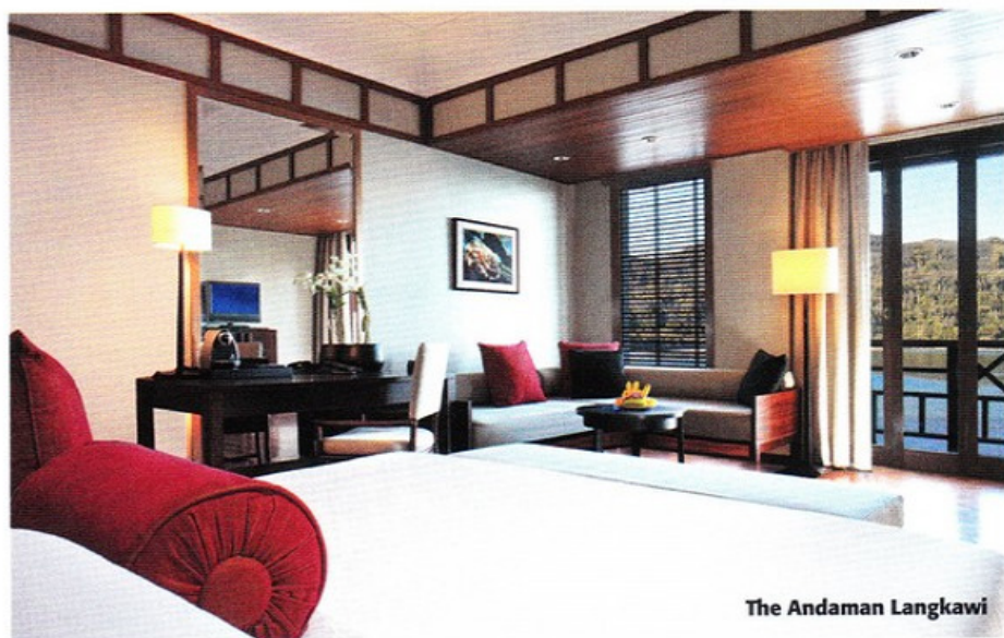
The Andaman Langkawi