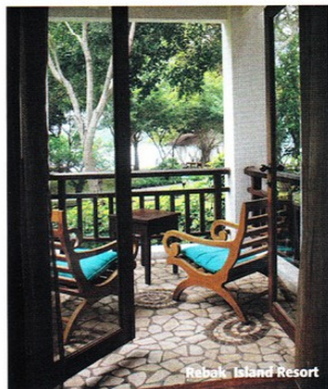
Rebak Island Resort